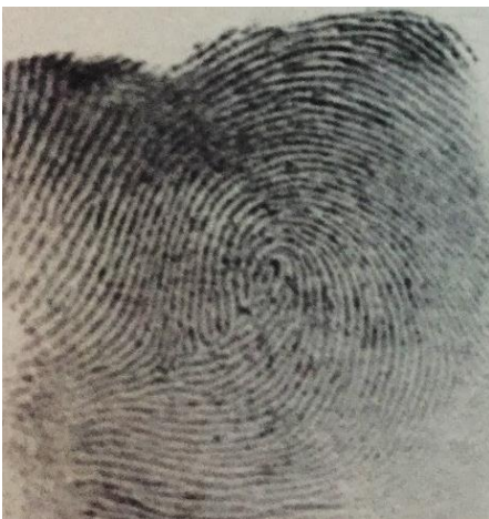
7. Double loop whorl