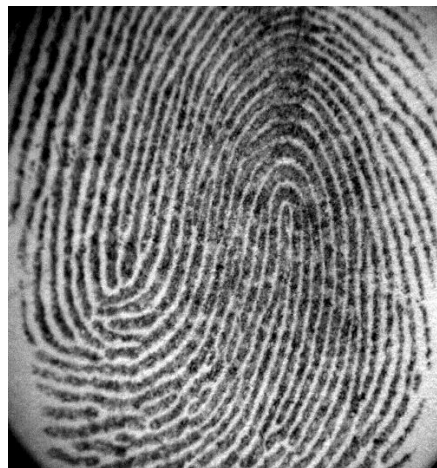
8. Ulnar loop