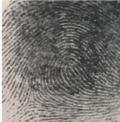
2. Accidental whorl