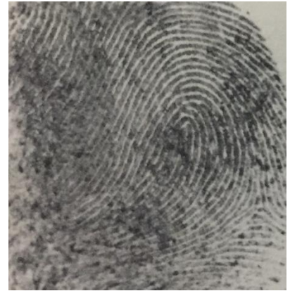
3. Radial loop