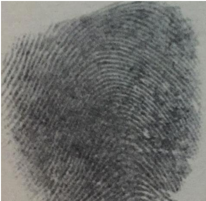
4. Plain arch