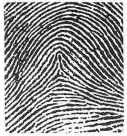
9. Tented arch