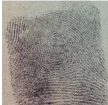
5. Central whorl